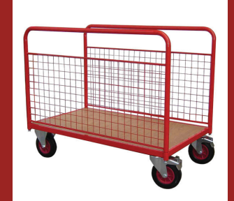
TWO SIDE PLATFORM TROLLEY