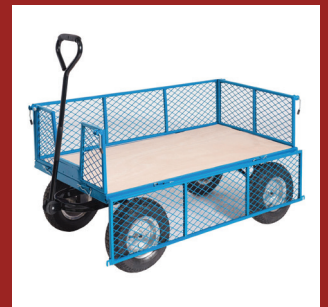
PLATFORM TRUCK TROLLEY