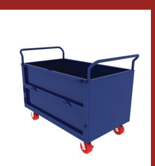
HAND PUSH STORAGE TROLLEY