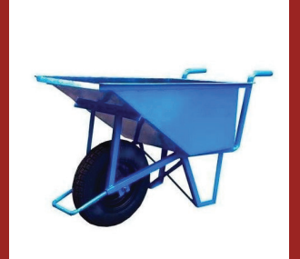
SINGLE WHEEL BARROW TROLLEY