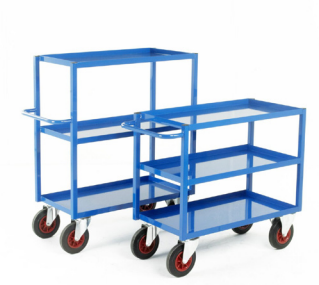
SHELF HEAVY DUTY TROLLEY